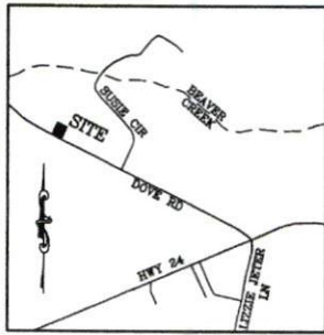
VICINITY MAP (NO SCALE)