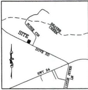
VICINITY MAP (NO SCALE)