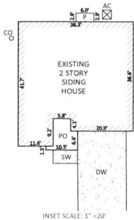
INSET SCALE: 1" = 20'

REFERENCE: BK 2020, PGS. 381-383 BCS# 200597 SCALE: 1" = 40'