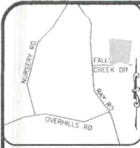
VICINITY MAP (NTS)