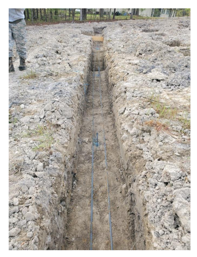
Page 4 of 4