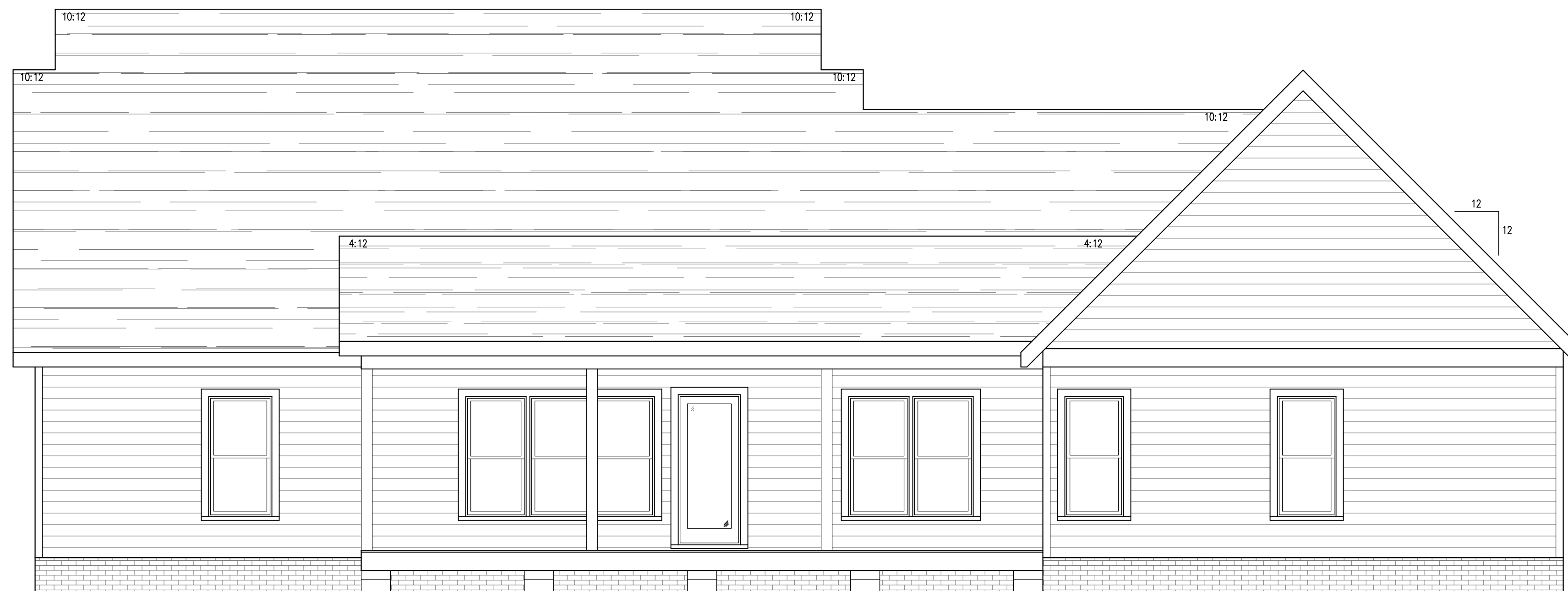
Rear Elevation Scale: 1/4" = 1'-0"

SPECIFICATIONS 1ST FLOOR HEATED AREA: 2094 SQ. FT. BONUS ROOM AREA: 436 SQ. FT. GARAGE AREA: 672 SQ. FT. FRONT PORCH AREA: 200 SQ. FT. REAR PATIO AREA: 248 SQ. FT. TOTAL HEATED SQ. FOOTAGE: 2094