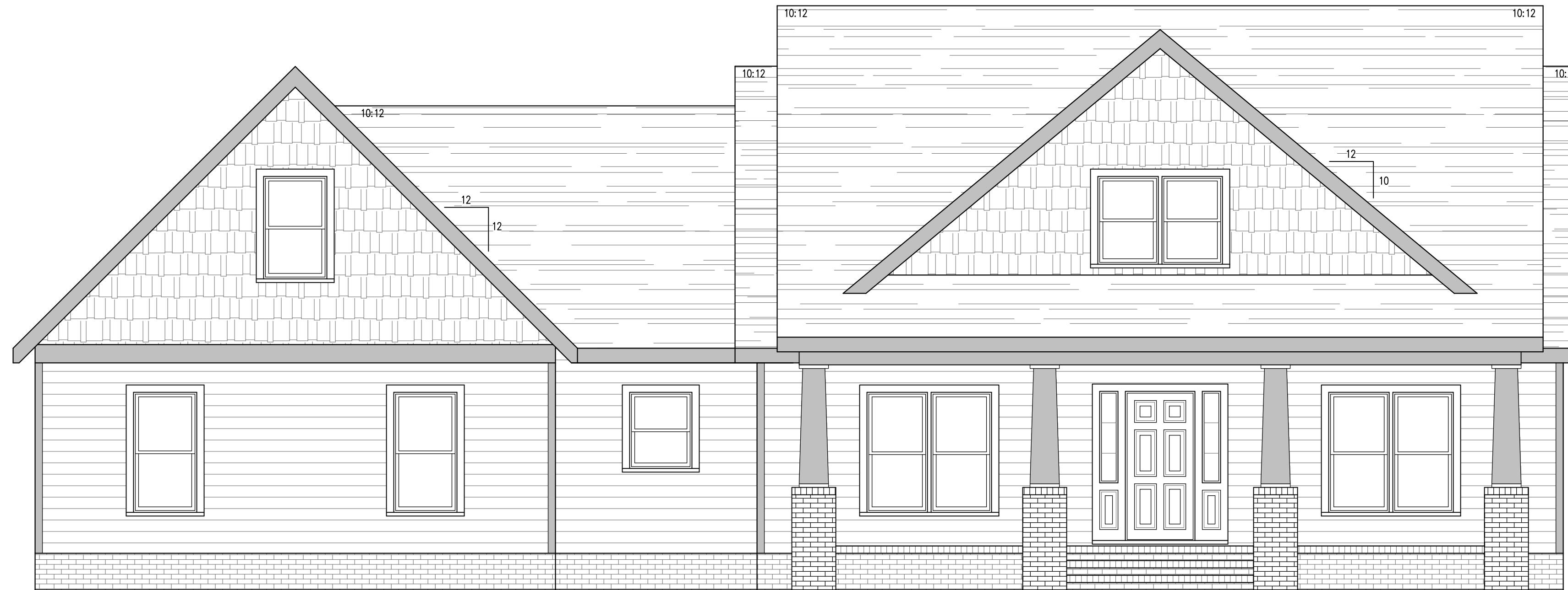
Front Elevation Scale: 1/4" = 1'-0"