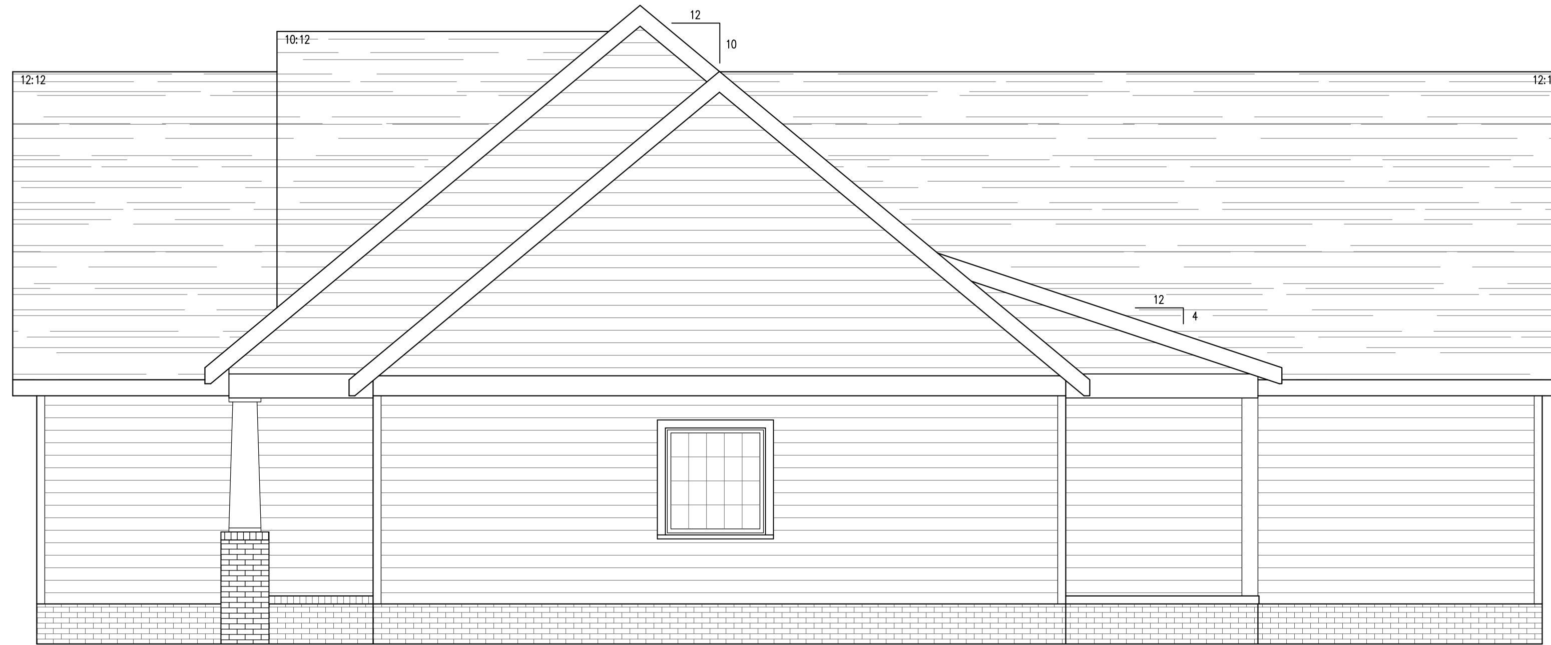
Right Elevation Scale: 1/4" = 1'-0"