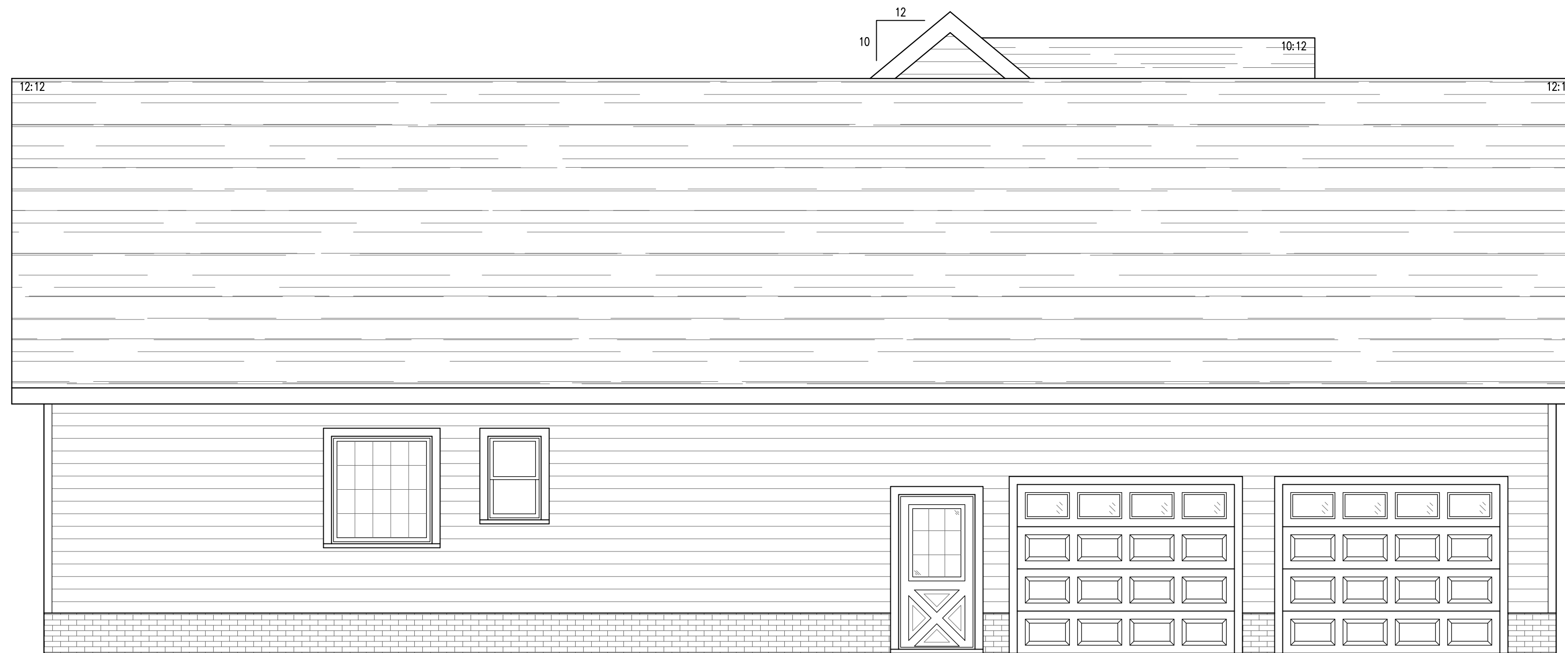
Left Elevation Scale: 1/4" = 1'-0"