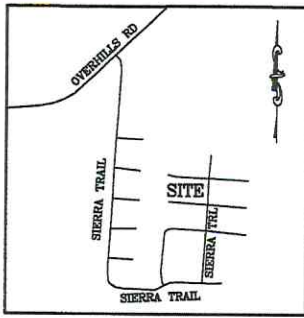
VICINITY MAP (NO SCALE)

NOTE : CONTRACTOR TO VERIFY ALL BUILDING SETBACKS PRIOR TO CONSTRUCTION.