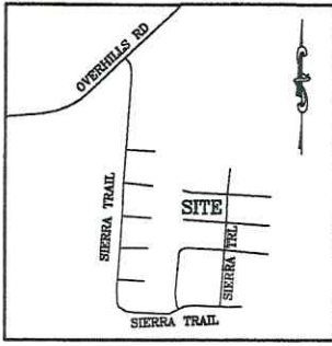
VICINITY MAP (NO SCALE)

NOTE : CONTRACTOR TO VERIFY ALL BUILDING SETBACKS PRIOR TO CONSTRUCTION.