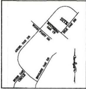
VICINITY MAP (NO SCALE)

NOTE : CONTRACTOR TO VERIFY ALL BUILDING SETBACKS PRIOR TO CONSTRUCTION.