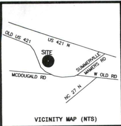
VICINITY MAP (NTS)