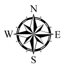
Figure: 2 1 inch = 40 feet 29 July 2019

Project Name: Lot #93 Keith Hills Location: Lillington, Harnett County, NC Parcel No: 0579-29-6086.000