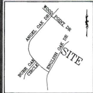
VICINITY MAP (NO SCALE)