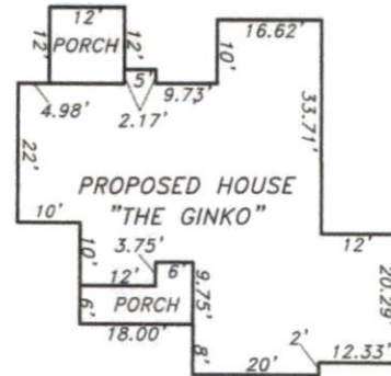
HOUSE DETAIL (NOT TO SCALE)