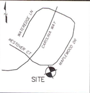
Vicinity Map (Not to Scale)

LEGEND R/W-RIGHT OF WAY DB-DEED BOOK PG-PAGE PROP-PROPOSED SF-SQUARE FEET AC-ACRE(S) CONC-CONCRETE ESMT-EASEMENT PL-PROPERTY LINE