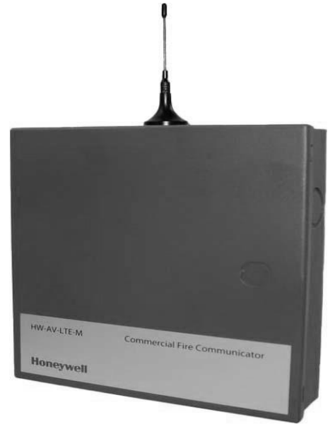
Metal enclosure (HW-AV-ENC) for housing CLSS Pathway (HW-AV-LTE-M)