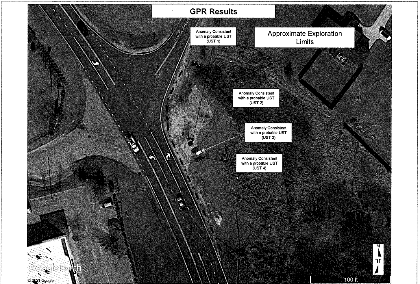
DIAGRAM IS FOR GENERAL LOCATION ONLY, AND IS NOT INTENDED FOR CONSTRUCTION PURPOSES