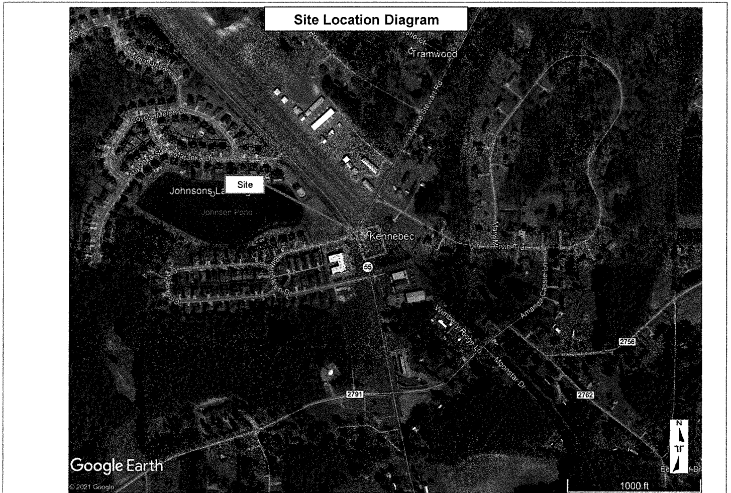
DIAGRAM IS FOR GENERAL LOCATION ONLY, AND IS NOT INTENDED FOR CONSTRUCTION PURPOSES.

Parcel #244 – Beryl Road Properties, LLC ■ Willow Spring, NC March 22, 2021 ■ Terracon Project No. 70207241