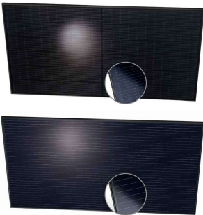
6 busbar cell technology

The most thorough testing programme in the industry Ocells is the first solar module manufacturer to pass the most comprehensive quality programme in the industry. The independent PV of the independent certification institute TÜV Rheinland.