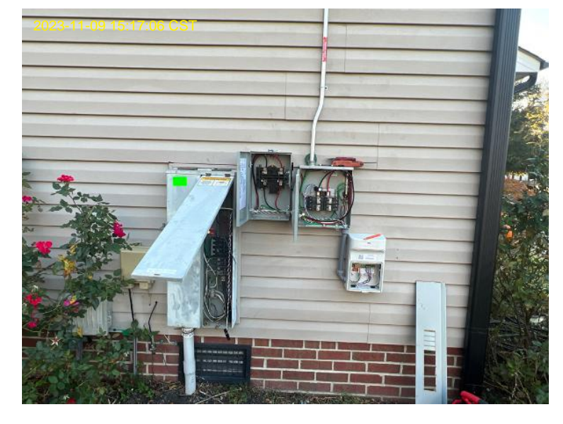
Interior of Enclosures / Wide Shot: EQ Wall w/o Deadfronts - Indoor & Outdoor

Alejandro Rodriguez Loc: 35.4555 , -78.7809