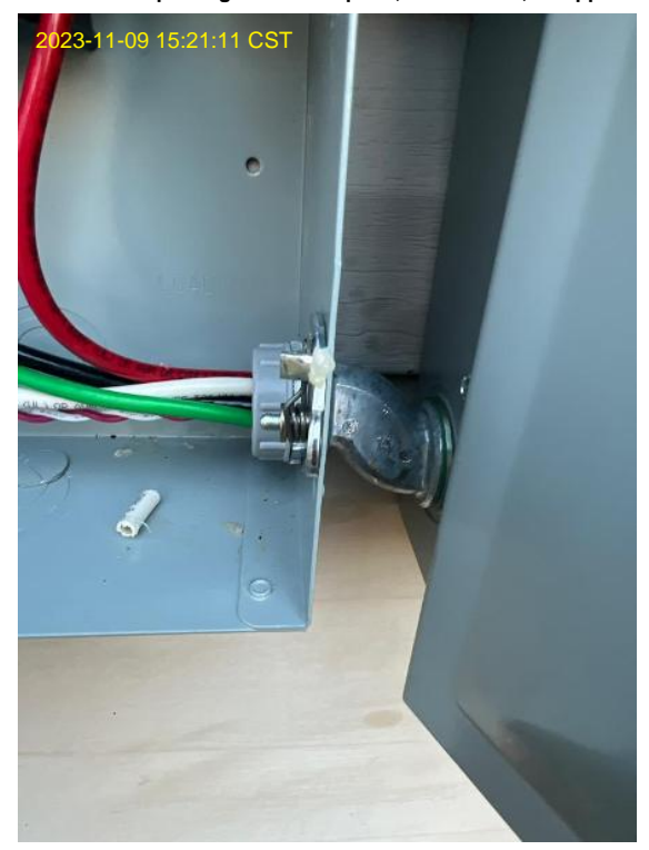
\operatorname{EMT}/\operatorname{Close} Up of Tightened Couplers, Connectors, & Nipples.

Alejandro Rodriguez Loc: 35.4555, -78.7809