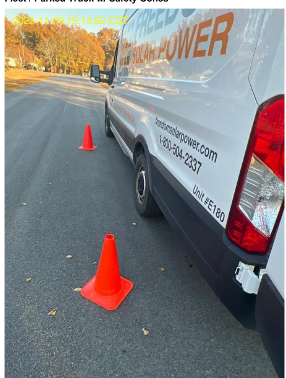
Fleet / Parked Truck w/ Safety Cones

Alejandro Rodriguez Loc: 35.4558 , -78.781