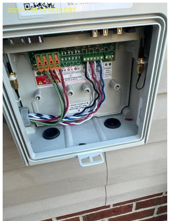
Interior of Enclosures \slash\hspace{-0.05cm} Close Up of Monitoring Equipment (Wiring & serial number)

Alejandro Rodriguez Loc: 35.4555 , -78.7809