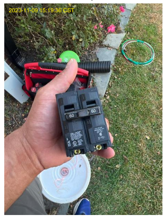
Breakers & Terminations / Close Up of Breaker

Alejandro Rodriguez Loc: 35.4555, -78.7809