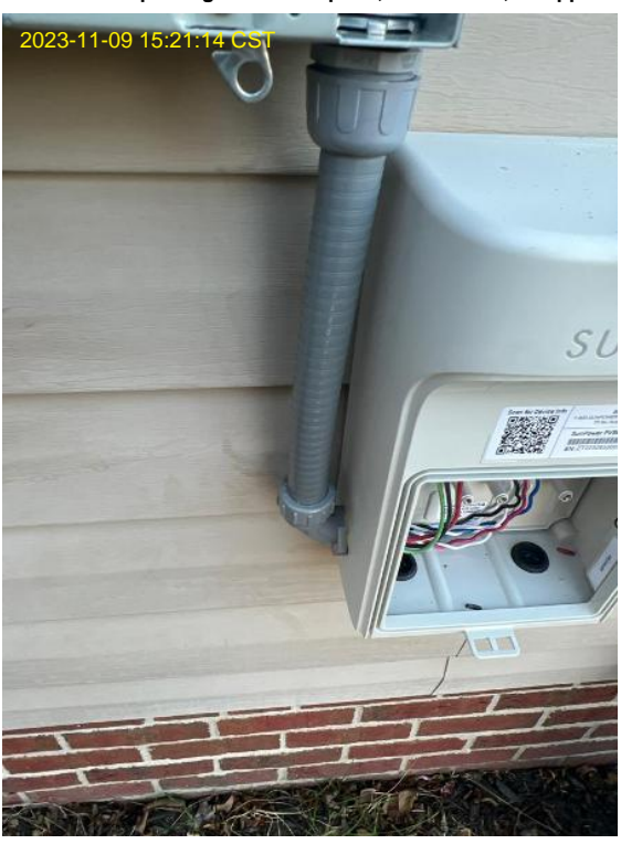
EMT / Close Up of Tightened Couplers, Connectors, & Nipples.