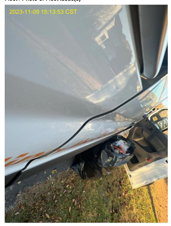
Fleet / Photo of Fleet Issue(s)

Alejandro Rodriguez Loc: 35.4557 , -78.781