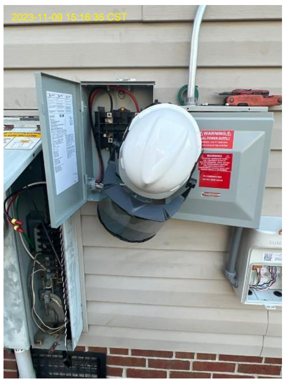
Safety / PPE - Face Shield near EQ wall