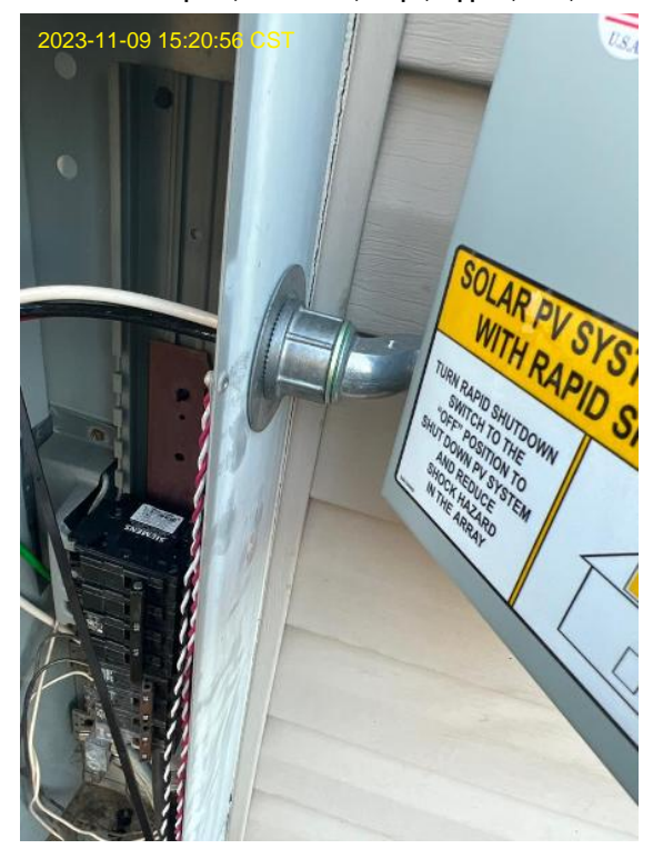
{\bf EMT\ /\ EMT\ -\ Couplers, Connectors, Straps,\ Nipples, Bend,\ etc.}

Alejandro Rodriguez Loc: 35.4555, -78.7809