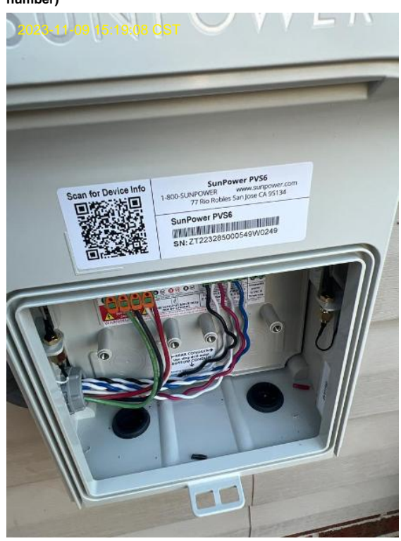
Interior of Enclosures / Close Up of Monitoring Equipment (Wiring & serial number)

Alejandro Rodriguez Loc: 35.4555, -78.7809