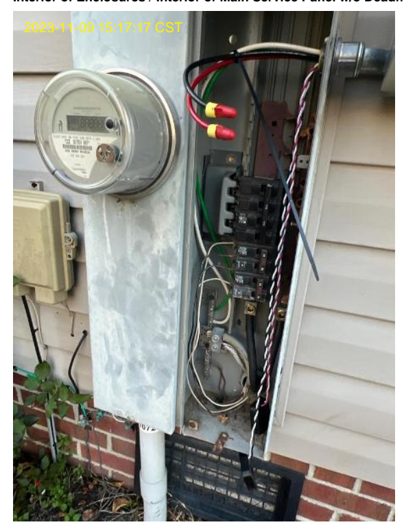
Interior of Enclosures / Interior of Main Service Panel w/o Deadfront

Alejandro Rodriguez Loc: 35.4555 , -78.7809