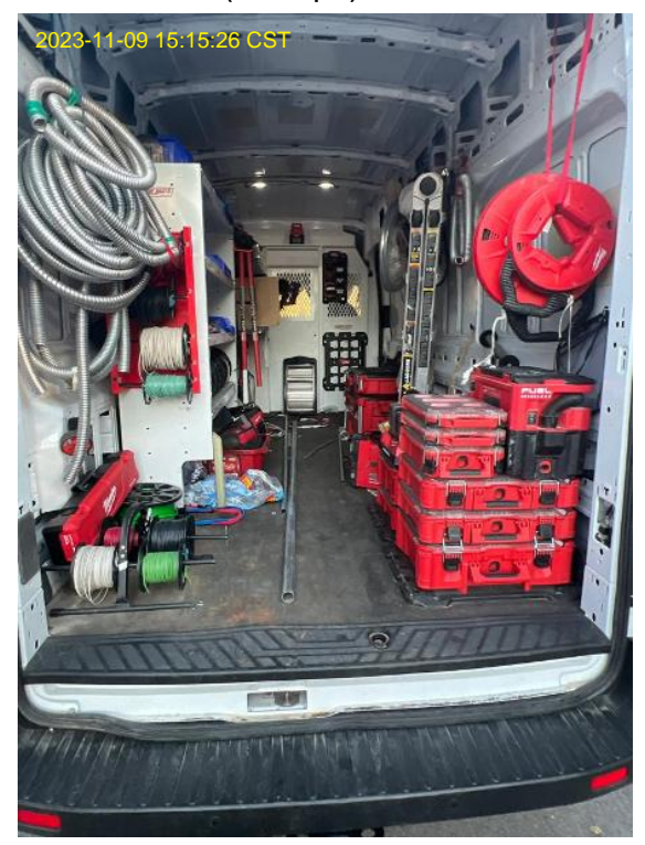
Fleet / Back of Truck (Doors Open)

Alejandro Rodriguez Loc: 35.4557 , -78.781