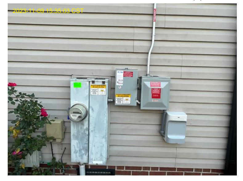
Exterior of Enclosures / Exterior of Main Service Panel (Labeled w/ Stickers)