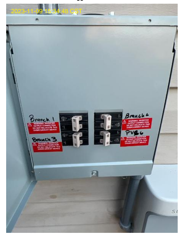
Exterior of Enclosures / Agg Panel w/ Deadfront

Alejandro Rodriguez Loc: 35.4555 , -78.7809