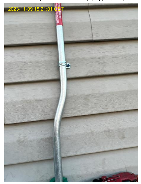
EMT / EMT - Couplers, Connectors, Straps, Nipples, Bend, etc.

Alejandro Rodriguez Loc: 35.4555 , -78.7809