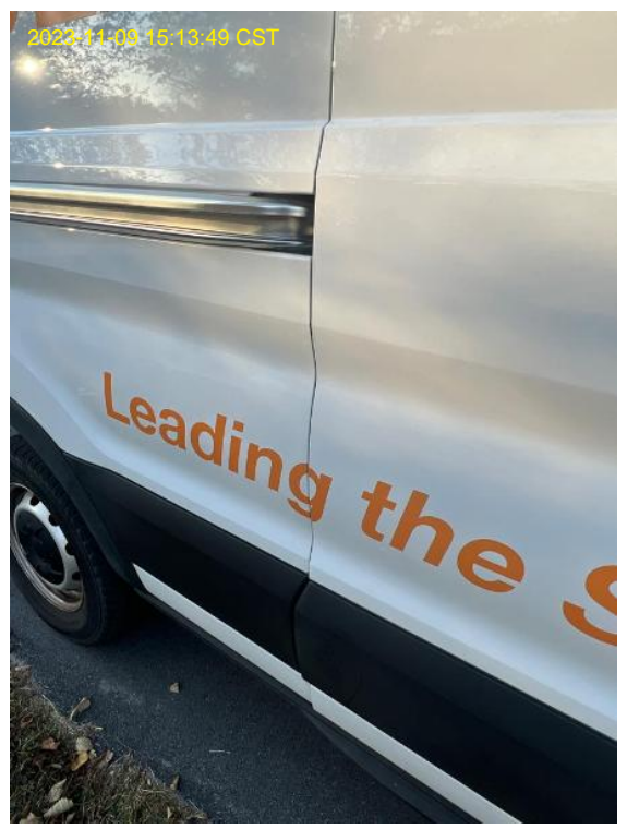
Fleet / Photo of Fleet Issue(s)

Alejandro Rodriguez Loc: 35.4557, -78.781