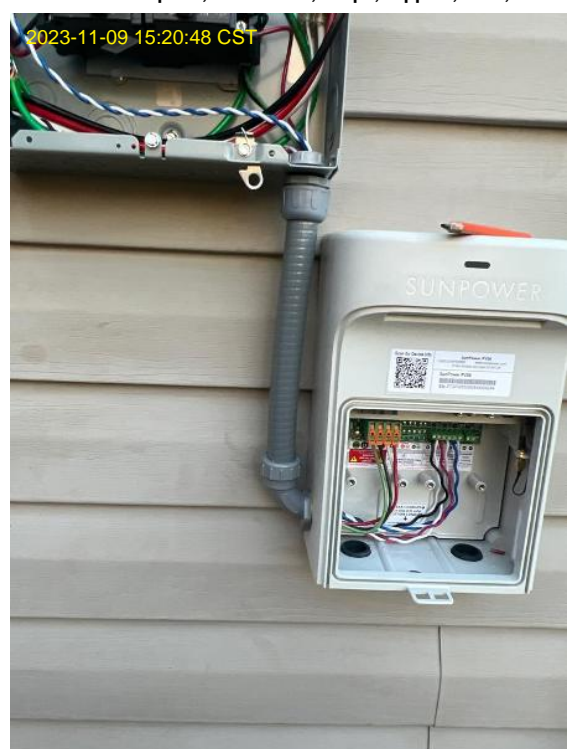
EMT / EMT - Couplers, Connectors, Straps, Nipples, Bend, etc.

Alejandro Rodriguez Loc: 35.4555 , -78.7809