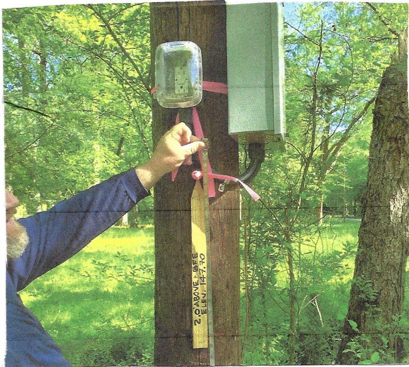
Photo One Caption ELECTRIC PANEL

If using the Elevation Certificate to obtain NFIP flood insurance, affix at least 2 building photographs below according to the instructions for Item A6. Identify all photographs with date taken; "Front View" and "Rear View"; and, if required, "Right Side View" and "Left Side View." When applicable, photographs must show the foundation with representative examples of the flood openings or vents, as indicated in Section A8. If submitting more photographs than will fit on this page, use the Continuation Page.