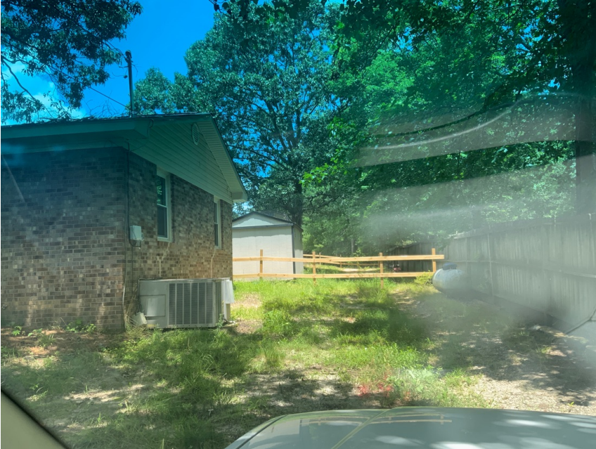
Photo of New OUTDOOR UNIT location

Where will the new OUTDOOR UNIT be installed?