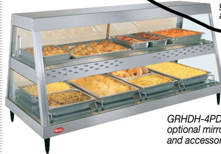
GRHDH-4PD with pan rail, optional mirrored glass doors and accessory food pans