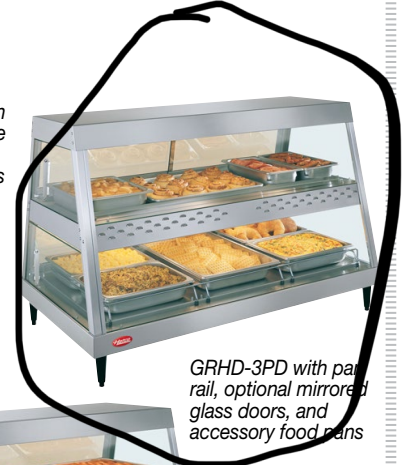
GRHD-3PD with pan rail, optional mirrored glass doors, and accessory food pans