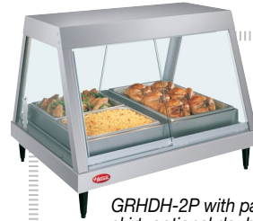
GRHDH-2P with pan skirt, optional double sided opening, and accessory food pans

For operation, location and safety information, please refer to the Installation and Operating Manual.