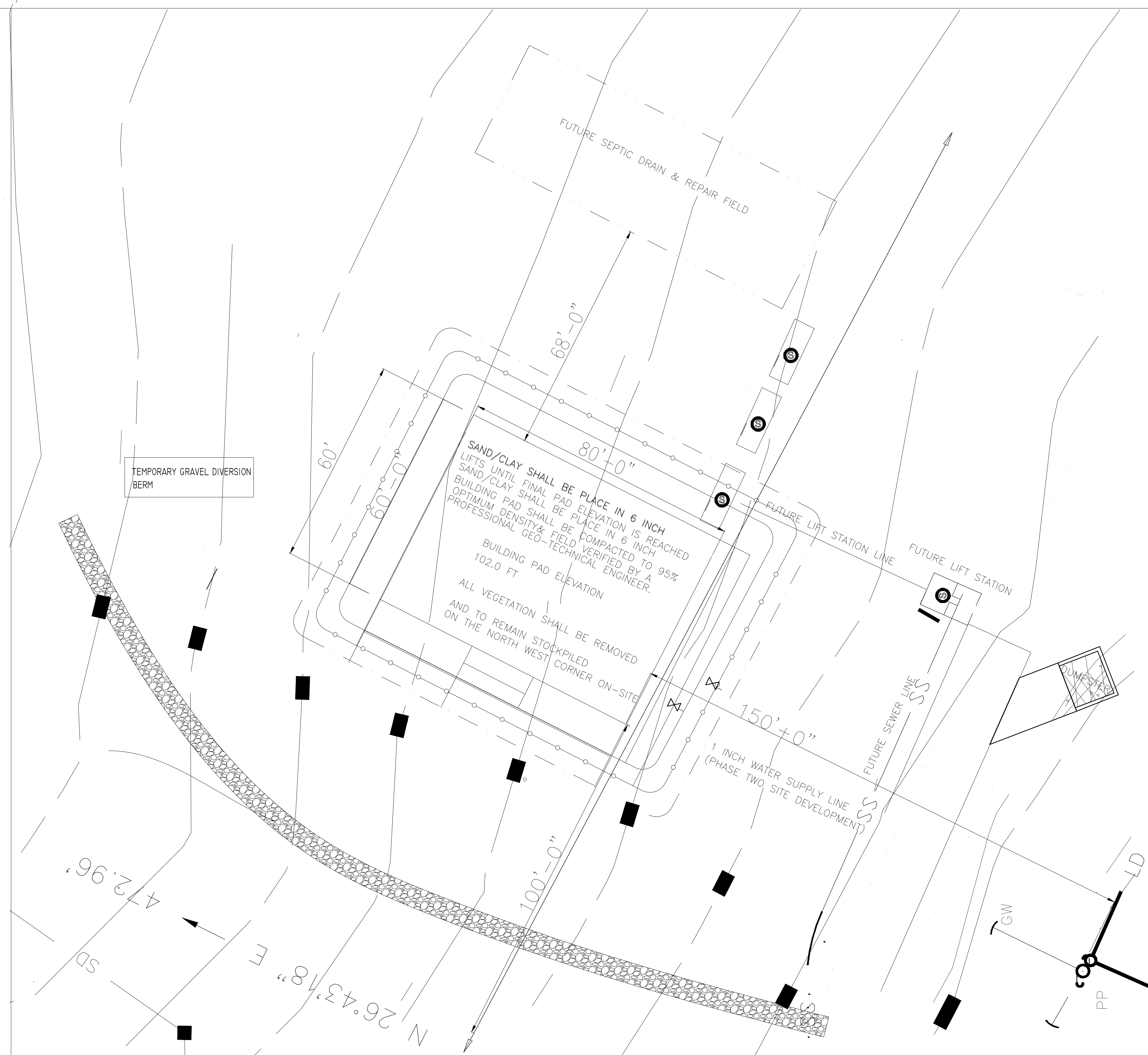
ENLARGED SITE DEVELOPMENT PLAN (EROSION CONTROL PLAN) SCALE: