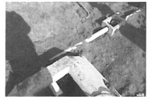
SR1780 Arrowhead rd 12-6-18