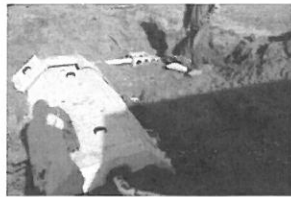
SR1780 Arrowhead rd 12-6-18