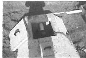
SR1780 Arrowhead rd 12-6-18