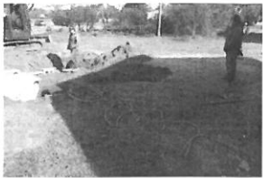
SR1780 Arrowhead rd 12-6-18