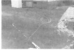
SR1780 Arrowhead rd 12-6-18