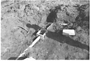
SR1780 Arrowhead rd 12-6-18