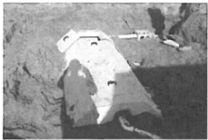
SR1780 Arrowhead rd 12-6-18