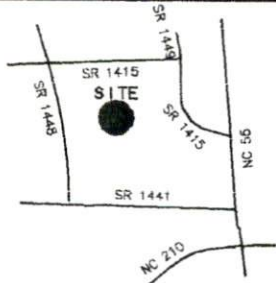
VICINITY MAP (N.T.S.)