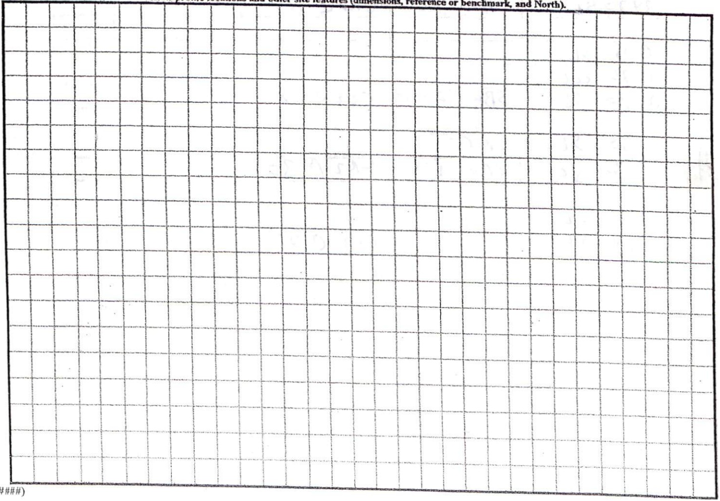
Show profile locations and other site features (dimensions, reference or benchmark, and North).