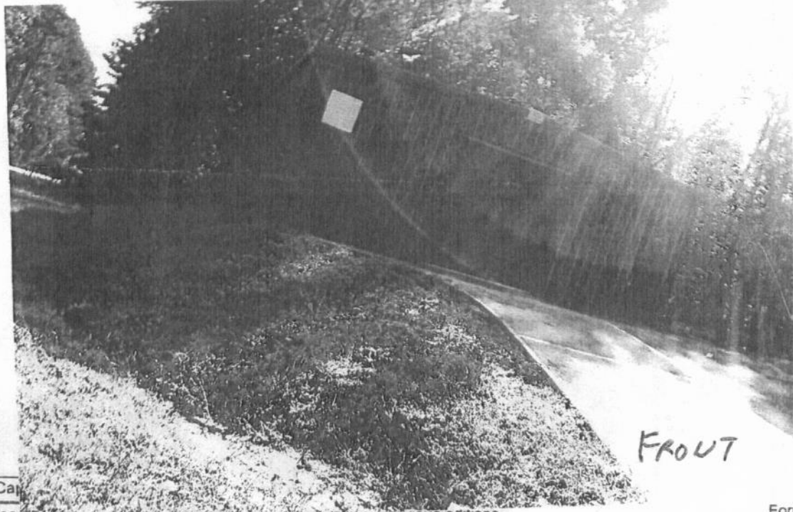
Clear Photo One