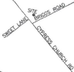
VICINITY MAP (NTS)