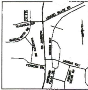
VICINITY MAP (NO SCALE)