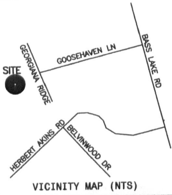
VICINITY MAP (NTS)