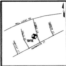
Vicinity Map (Not to Scale)