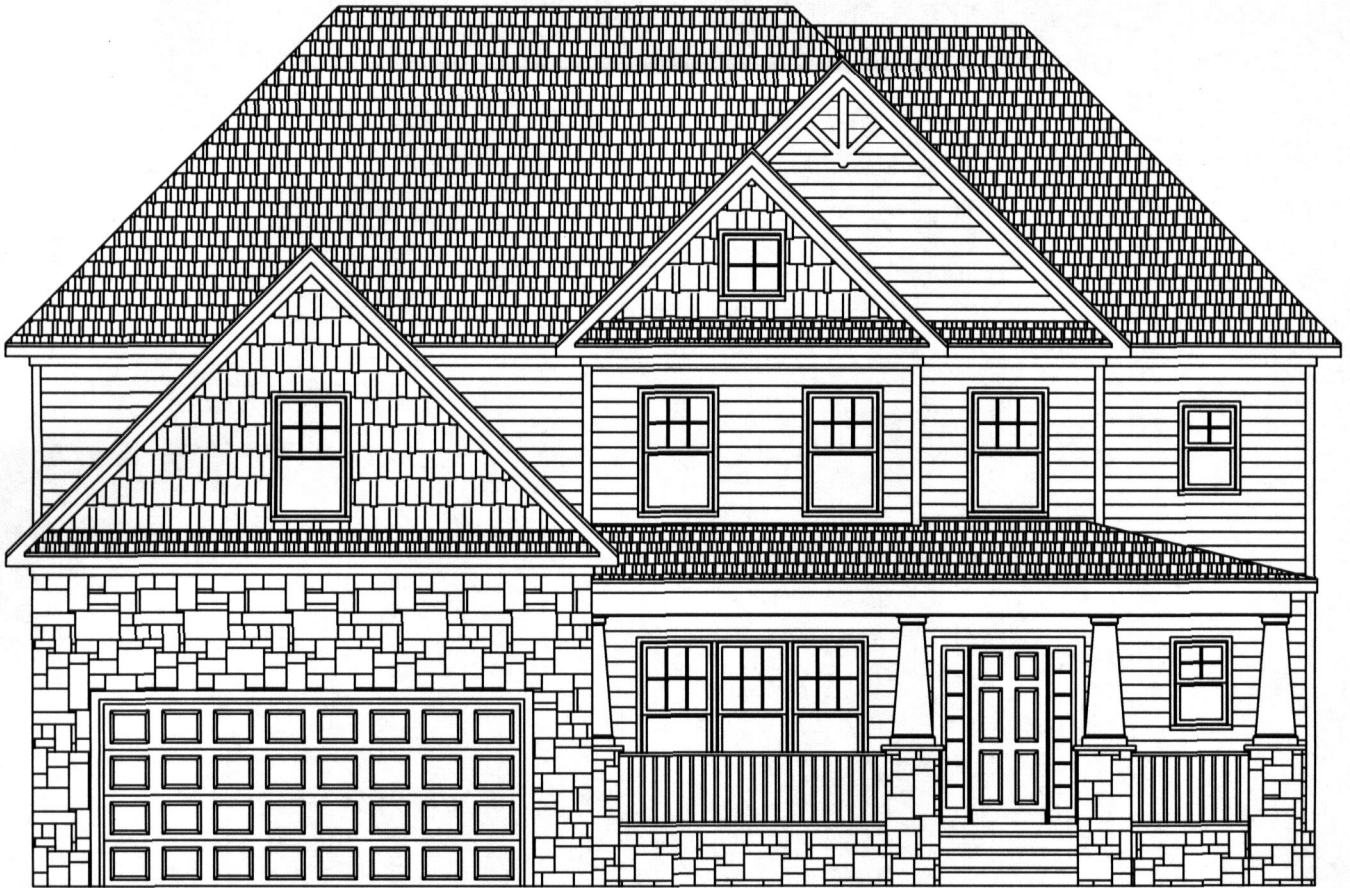
FRONT ELEVATION 'B'