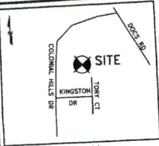
Vicinity Map (Not to Scale)