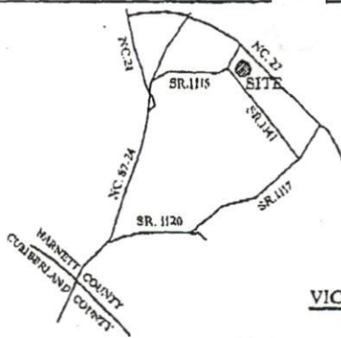
VICINITY MAP (N.T.S.)