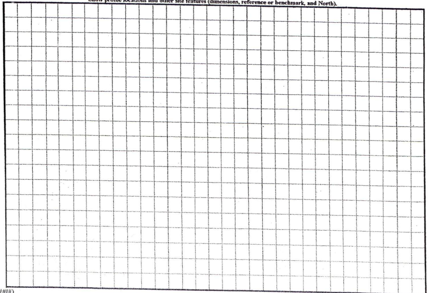
Show profile locations and other site features (dimensions, reference or benchmark, and North).