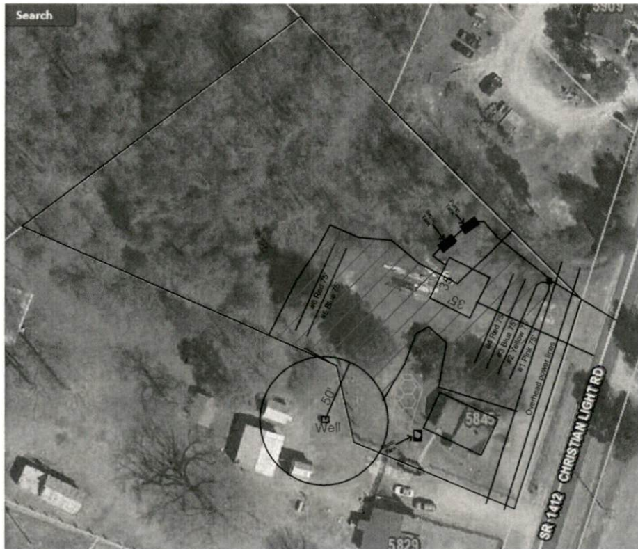
Proposed New 2-Bedroom Home