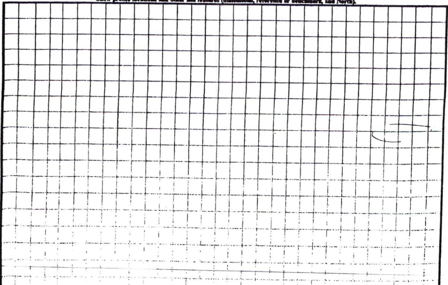
Show profile locations and other site features (dimensions, reference or benchmark, and North).