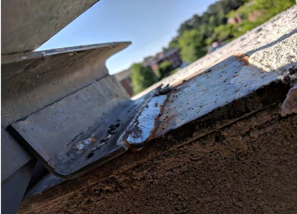
Joist End Weld