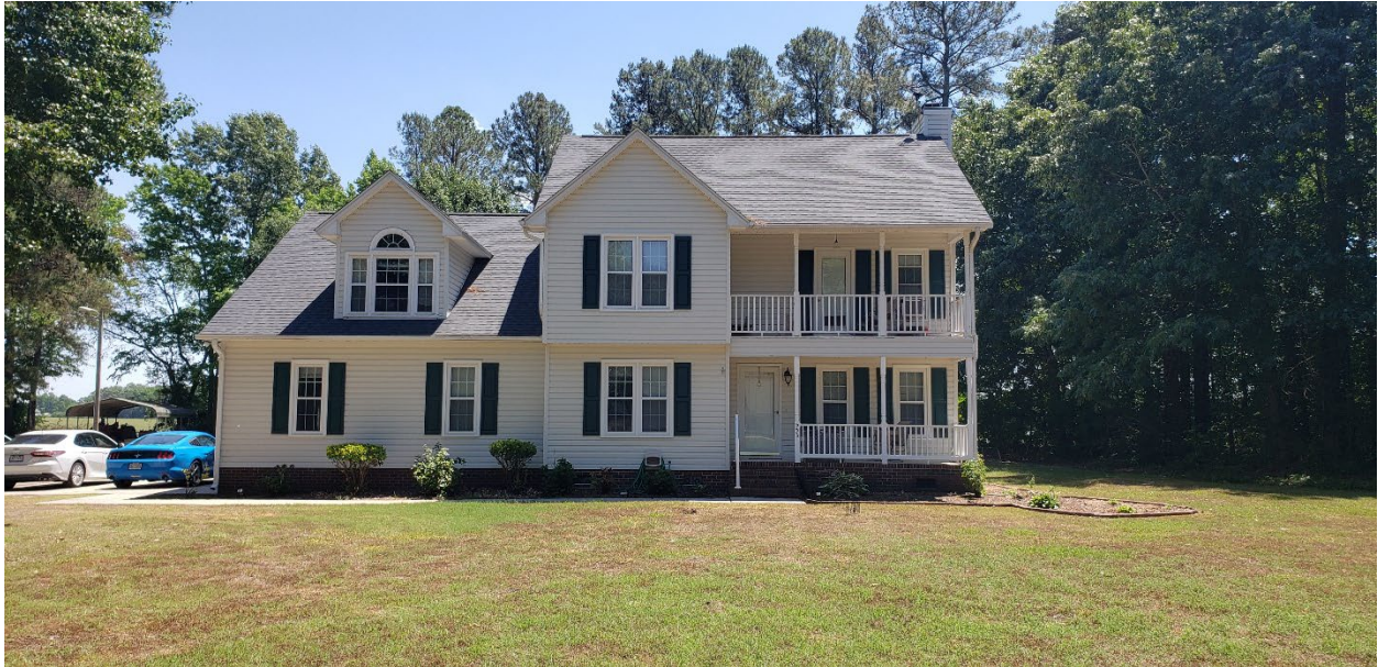
Front of Residence