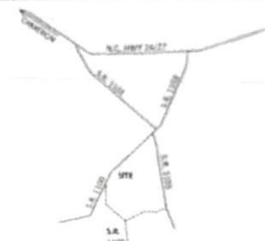
VICINITY MAP - NOT TO SCALE

SURVEY FOR CARL MILLER AND WIFE, MELISSA MILLER JOHNSONVILLE TOWNSHIP HARNETT COUNTY, N.C. JULY 18, 2020 SCALE: 1" = 200'