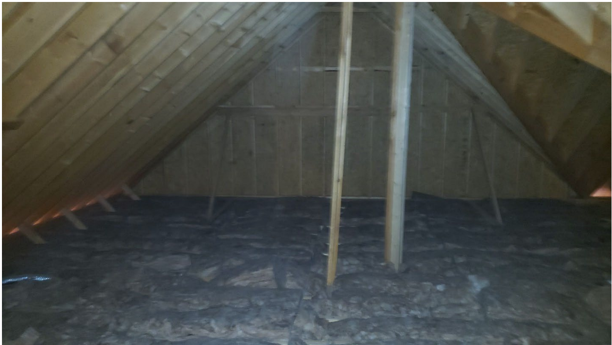
Proposed finished attic space