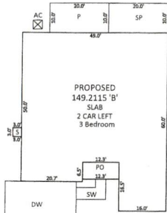
INSET SCALE: 1"=20'

PIN: 0652-04-1739-000 TOTAL LOT AREA = 0.588 AC = 25,606 SF HOUSE = 2,530 SF PORCH = 70 SF SIDEWALK = 50 SF DRIVEWAY = 936 SF SCREENED PATIO = 200 SF PATIO = 200 SF AC PAD = 9 SF STPOOP = 9 SF PROPOSED IMPERVIOUS = 3,984 SF PERCENT IMPERVIOUS = 15.56% MAXIMUM ALLOWED IMPERVIOUS = 4,000 SF