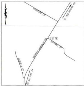
VICINITY MAP NO SCALE

I, JOSHUA C. MURDOCK, CERTIFY THAT THIS PLAT IS OF A SURVEY THAT CREATES A SUBDIVISION OF LAND, THAT IS REGULATED BY COUNTY OR MUNICIPALITY ORDINANCE THAT REGULATES PARCELS OF LAND, THAT THE BOUNDARIES NOT SURVEYED ARE CLEARLY INDICATED AS SUCH AND WERE PLOTTED FROM INFORMATION AS REFERENCED HEREON, THAT THE RATIO OF PRECISION IS 1:10,000+ AND THAT THE GLOBAL NAVIGATION SATELLITE SYSTEM (GNSS) WAS USED TO PERFORM THIS SURVEY. THE FOLLOWING INFORMATION WAS USED: CLASS OF SURVEY: CLASS A POSITIONAL ACCURACY: 0.10' TYPE OF GPS FIELD PROCEDURE: RTK NETWORK (VRS) DATE(S) OF SURVEY: 04/01/2024-04/02/2024 DATUM/EPOCH: NAD83(2011) PUBLISHED/FIXED-CONTROL USE: CONTINUOUSLY OPERATING REFERENCE STATION(S) (CORS) GEOID MODEL: 2018 COMBINED GRID FACTOR: 0.99987779 UNITS: US SURVEY FEET NO NC GEODETIC SURVEY MONUMENT LOCATED WITHIN 2,000 FEET OF SUBJECT PROPERTY. I FURTHER CERTIFY THAT THIS PLAT MEETS THE REQUIREMENT OF THE STANDARDS OF PRACTICE FOR LAND SURVEYING IN NORTH CAROLINA (21 NCAC 56 .1800) AND THAT THIS PLAT WAS PREPARED IN ACCORDANCE WITH G.S. 47-30 AS AMENDED. WITNESS MY HAND AND SEAL THIS 6TH DAY OF APRIL, 2024.