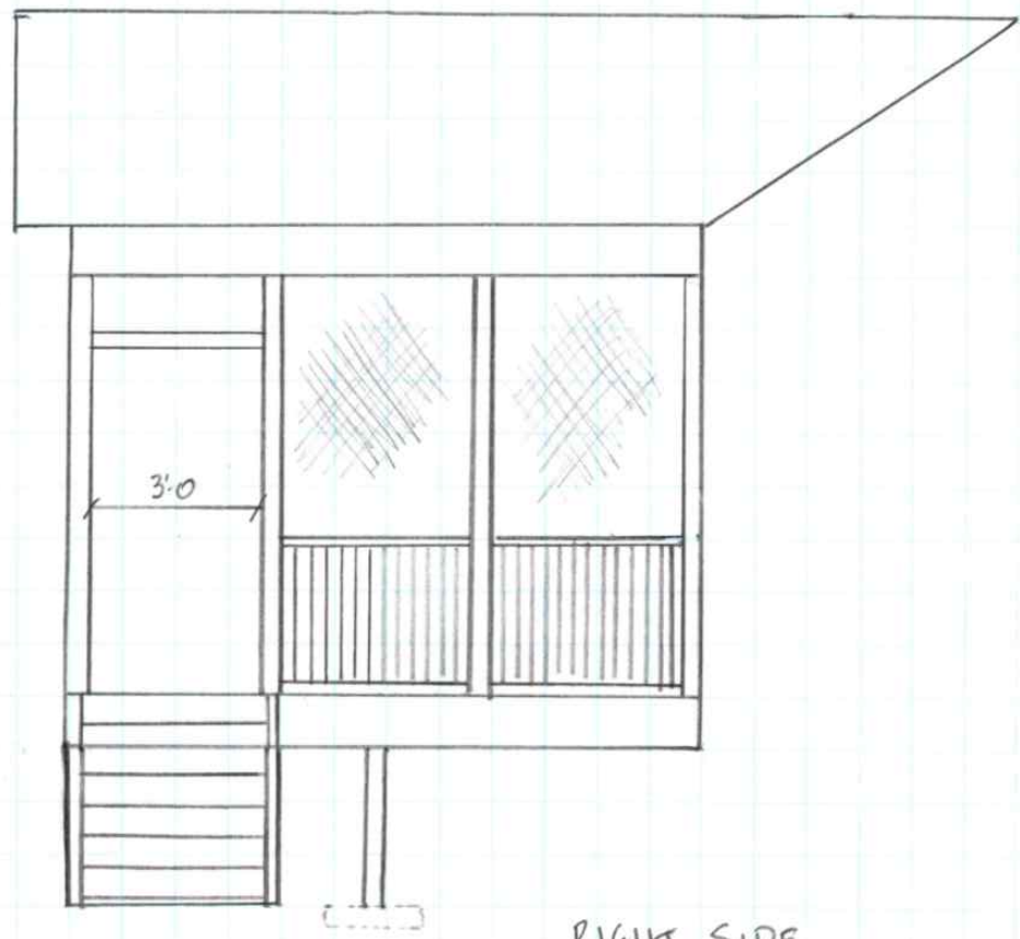
RIGHT SIDE \frac{1}{4}'' = 1'-0''