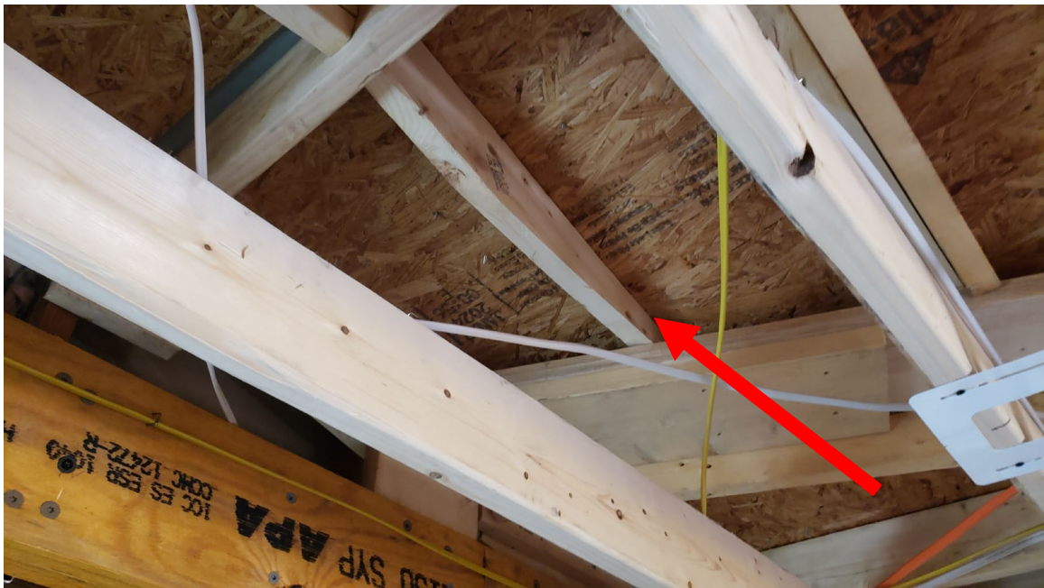
Item 2 Example