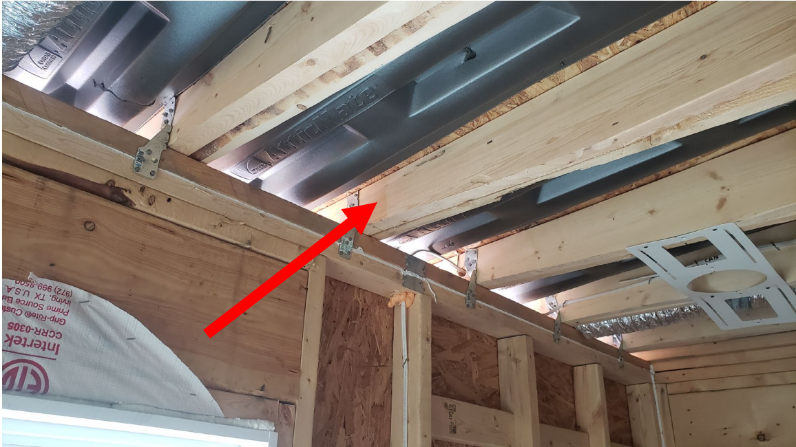
Item 1 Example