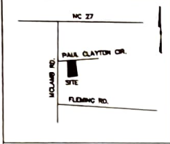
LOCALITY MAP (NTS)