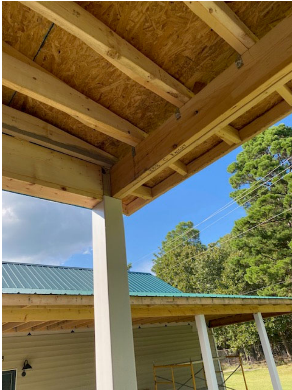
Outside bearing location of the rafters (Figure 2.0).