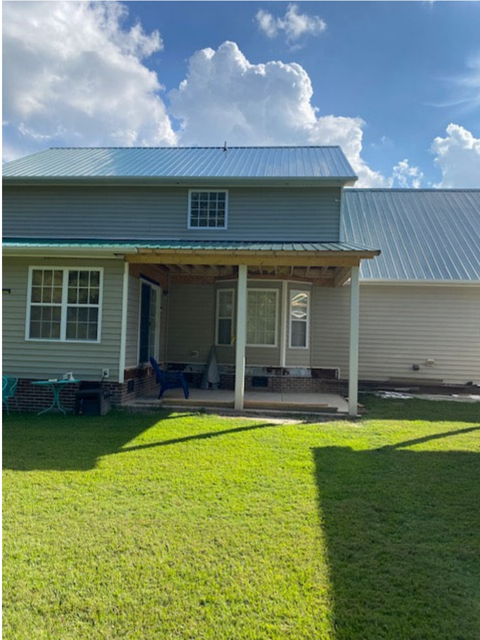
Covered Patio, view from back of the house.