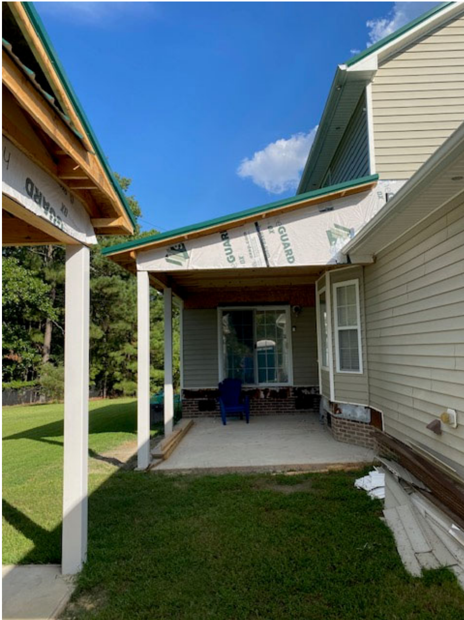
Covered Patio, view from side of house.