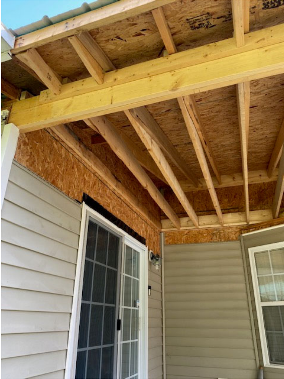
View of rafters at outside bearing location.