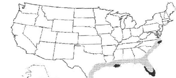
WIND ZONE: ○ Zone 1 □ Zone 2 △ Zone 3 South 20 PSF

This manufactured home IS NOT designed to accommodate the additional loads imposed by the attachment of an attached accessory building or structure in accordance with the manufacturer installation instructions.