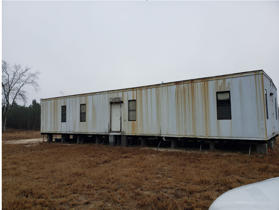
No perimeter curtain wall on continuous footing observed