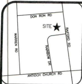
VICINITY MAP (NTS)